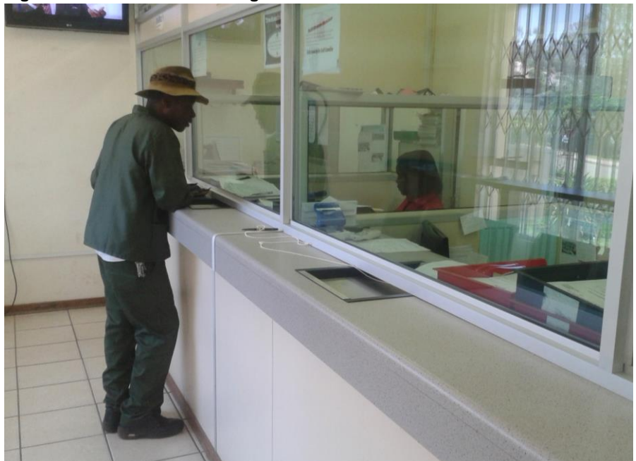
Figure 5: A member conducting a transaction at a branch of Sibonelo SACCO

According to a survey conducted by the Commissioner of Co-operatives, the most commonly cited reasons for a SACCO's success is member involvement, followed by high commitment and vision, patience, good corporate governance and cooperation among members. The most commonly cited reasons for failure include poor capitalization, poor member capacity and lack of technology.