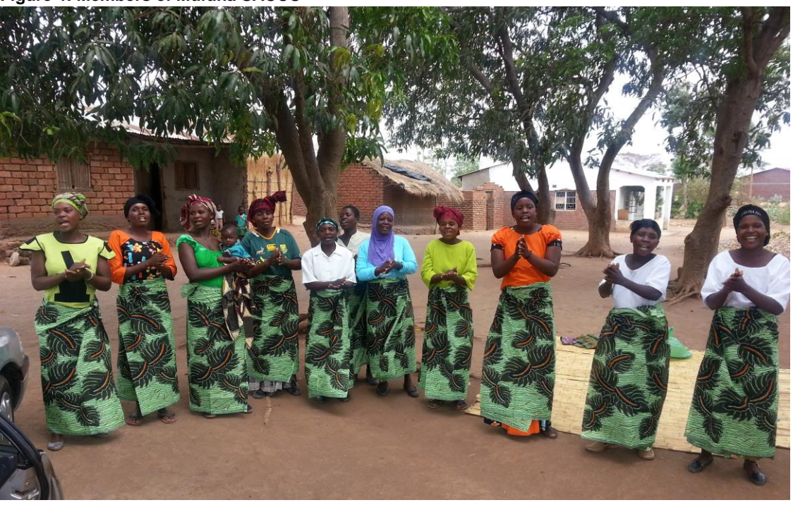
Figure 4: Members of Mufuna SACCO

The table below provides some key statistics for the SACCO sector in Malawi today.