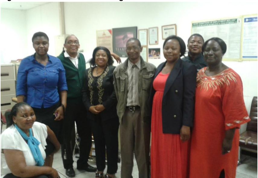
Figure 2: Board members of Boikago SACCO

Most CFIs provide regular or basic savings products to members along with special purpose contractual savings products, such as Christmas or school fees savings. Regular savings are withdrawable while, for the contractual accounts, a member agrees to deposit a fixed amount each month and then withdraws all the funds at a specified date. Many smaller CFIs would like to expand their savings products to include fixed deposit or more special purpose savings products. Faced with increasing competition from banks, some of the larger CFIs would like to broaden their service offerings to include more transactional services, such as debit cards, internet banking, as well as funeral and other insurance products.